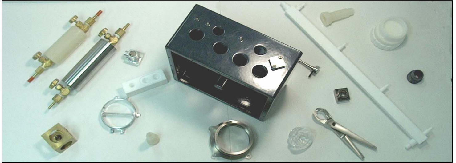
A few machining examples to show variety of quality work performed at Extreme Machining Inc..